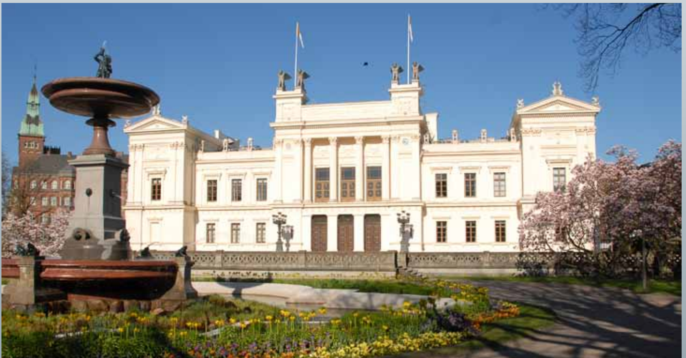
Lund University Main Building