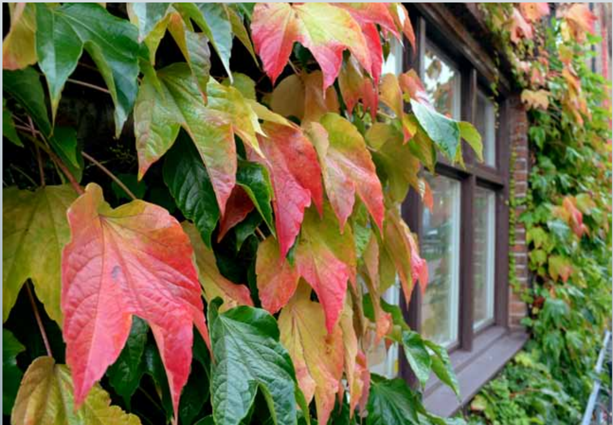
Palaestra et Odeum, Lund University