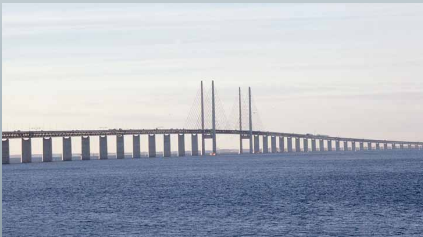
The Öresund Bridge